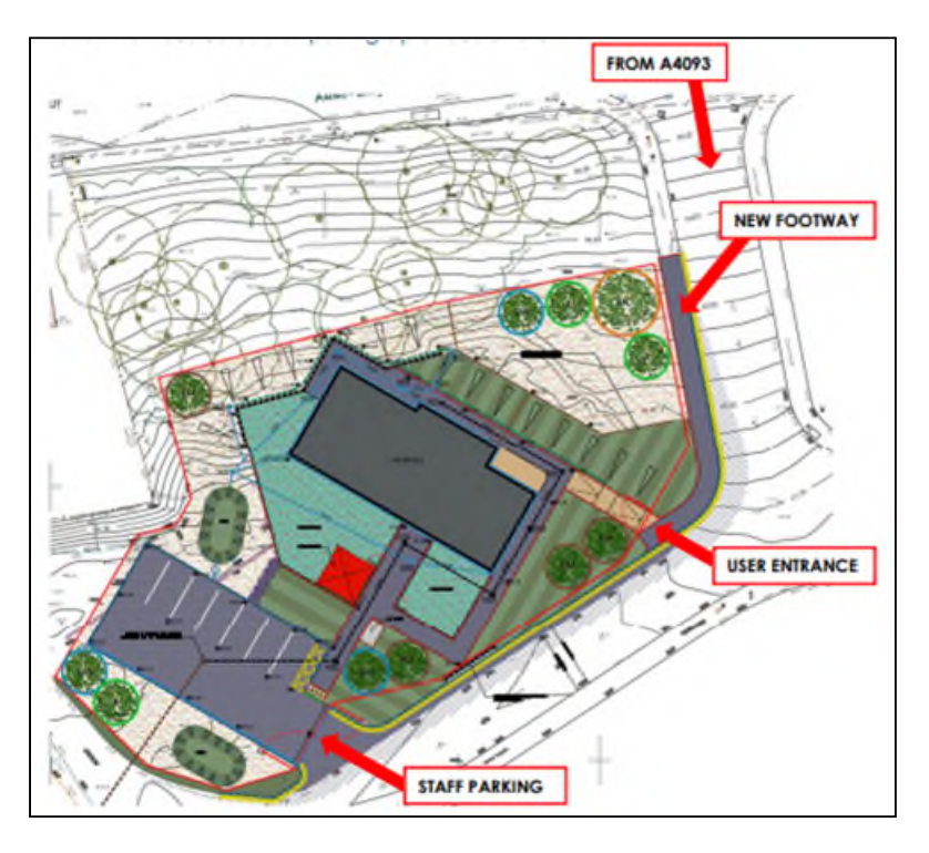
Fig. 3 – Proposed Access and Parking Layout

The reception area of the building will be accessed at the south eastern corner of the site from a new section of footway on the Isfryn Industrial Estate road. The area to the front and side of the building will be either grassed, turfed or finished with a rubber crumb soft-play surface. A small canopy will be erected over part of the soft play area to provide shade and shelter. A car parking area for 7 vehicles will be provided forward of the building accessed at the south western corner of the estate road.