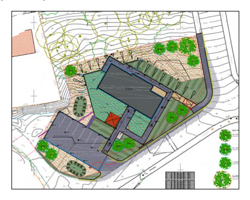
Fig. 4 – Proposed Landscaping

Retaining walls will be required around the northern corner of the new building which projects into the rising ground. The site will be enclosed by 2.3m high security perimeter fence. Areas of new tree planting are also incorporated into the layout with the main concentrations being on the elevated ground to the rear of the new building. An extract of the site layout plan is re-produced below: