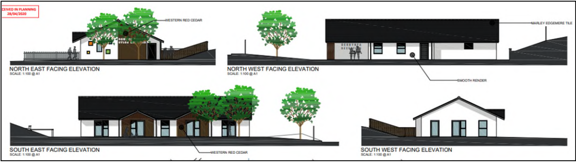
Fig. 2 – Proposed Elevations

The new single storey building will occupy the lower parts of the site, positioned at an angle to the respective boundaries and orientated to face a south westerly direction. The footprint of the building will measure 21m x 10m with a pitched roof reaching 5.2m from the finished ground levels. Accommodation will comprise areas of play space, quiet rooms, storage rooms, offices and ancillary facilities designed to cater for up to 34 children ranging from 0-5 years and 8 members of staff.